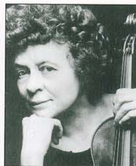
VG Rittenhouse 21